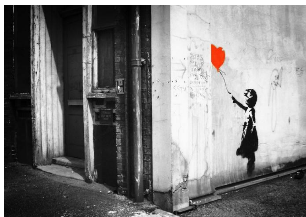
'The girl with a balloon' www.flickr.com, 2002