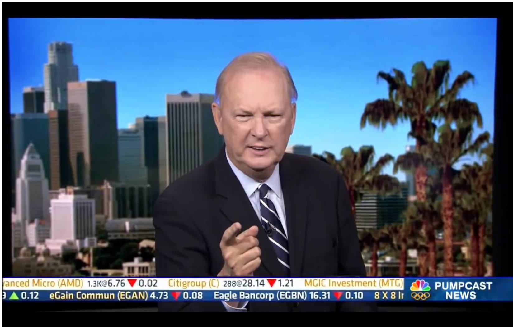
Source : Pumpcast-News-Part-1---The-Tonight-Show-with-Jay-Leno