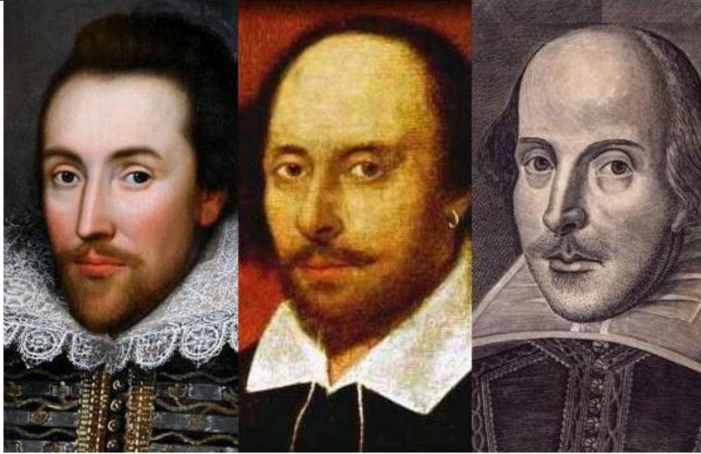
Figure 1 : https://upload.wikimedia.org/wikipedia/commons/fff/Shakespeare_Portrait_Comparisons_2.JPG